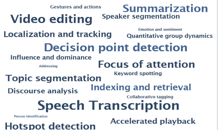
Figure 1. Core Technologies

Within the context of this Research Vision, AMIDA is developing an application vision. In the AMIDA application vision we will develop several demonstration applications, each of which will be a Meeting Assistant. Examples of the possible functionalities are shown in Table 1. While not all of these applications will be developed in AMIDA, the table shows the general framework: while most of the work in AMI focused on the bottom right quadrant (content browsing between meetings), AMIDA will address several of the other areas outlined in the table. In particular, the focus will be on developing tools for use during meetings, making use of and improving the core AMI technologies. These technologies are outlined in figure 2. The size of the text is a rough indicator of the level of importance of each of these technologies in AMIDA.